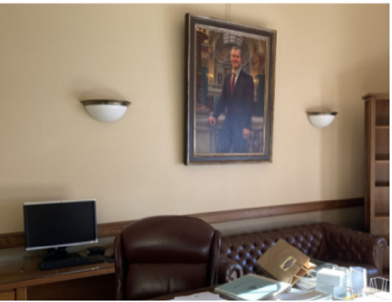
Works of art including portraits and landscapes as well high-quality scanned replicas of historic maps, photographs, posters, letters and treaties are available through the program.